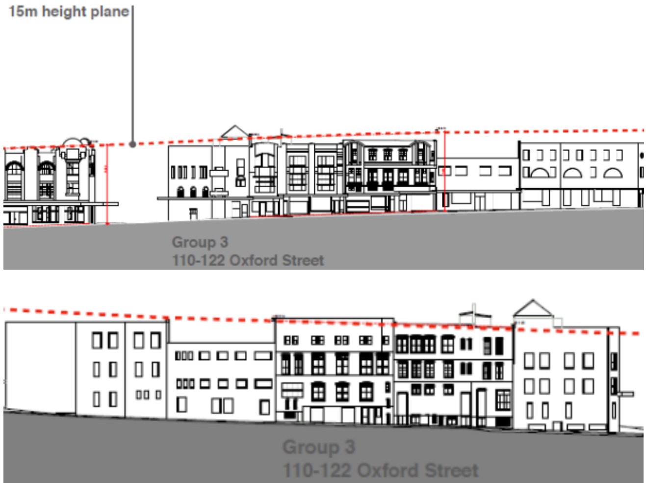
Figure 3 Existing heritage buildings and the 15m height plane