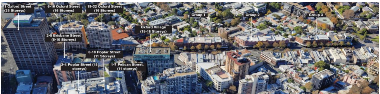
Figure 5 Building context and surrounding building heights

It is considered that notwithstanding the non-compliance with the height of buildings standard, the proposal meets the aims of objective 4.3(1)(a).