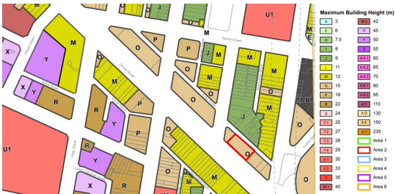
Figure 2 Height of Buildings Map (site outlined in red)

This written variation request made under clause 4.6 seeks to justify a proposed contravention of the height of buildings development standard set out in the Sydney LEP 2012. Under clause 4.3 of the Sydney LEP 2012, the site is mapped with a height of 15 metres as shown on the Height of Buildings Map (sheet 015) (refer to Figure 2 ).