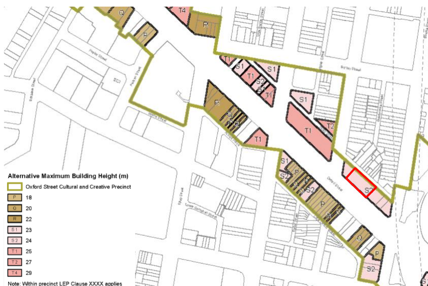
Figure 1 Endorsed site-specific maximum height of building map